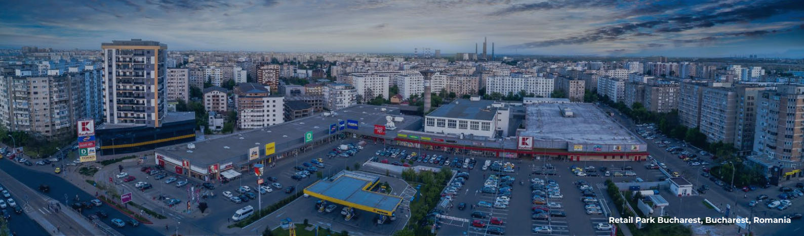
Retail Park Bucharest, Bucharest, Romania